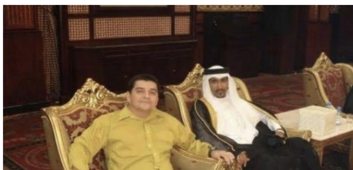
AL SHAMAL SPORTS CLUB (QATAR)